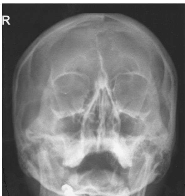
Figure 1 – Standard X-ray image

Native examination computed tomography images emphasize circumferential thickening of the frontal sinus mucosa, without evidencing the heterodense infra and supratentorial intracerebral lesions. These structures can be observed in axial, as well as coronal reconstructions in the figures above. The reconstructed coronal computed